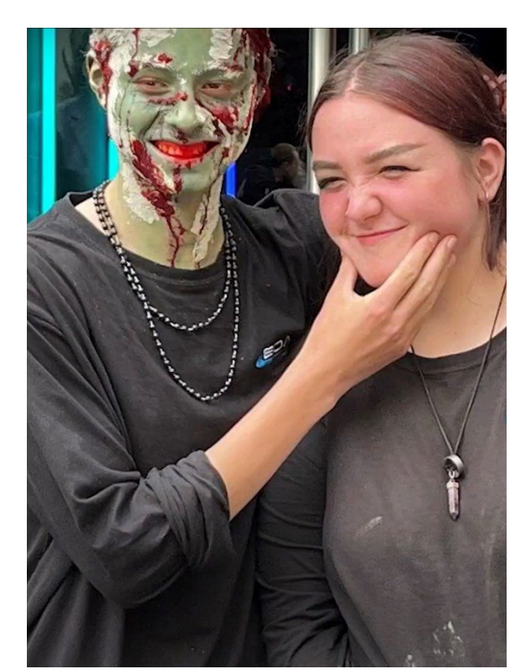
Photo: BOA Stage and Screen students gave SFX makeup demonstrations at the recent film festival in Digbeth.

During the first week (induction) we will provide students with their personalised timetables. Students will also apply for placements and roles in our major forthcoming projects and have a chance to speak to a range of industry professionals about the best possible routes into the world of work. They will also explore university options and apprenticeships.