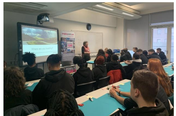
Careers Day – student workshop

Many of the visitors commented on how interesting and engaged our students were – well done to all!