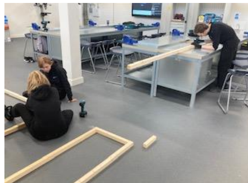
Set building in our new workshop

Tickets are now on sale, at https://www.ticketsource.co.uk/boa but hurry – only limited places are available!