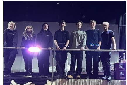
Production crew at The Old Rep theatre